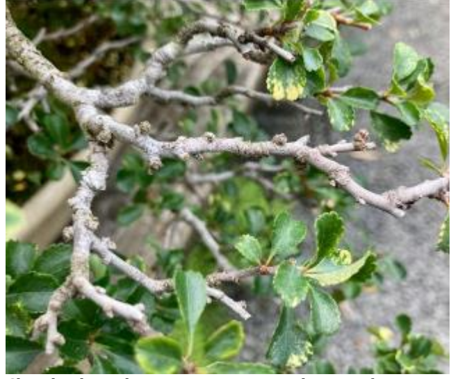
Chojubai branch, representing several years of directional pruning. No wire has been used. In fact, it would be hard to create these micro-movements with wire.