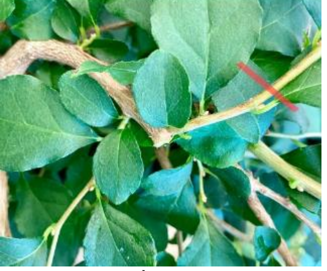
second suggest cut