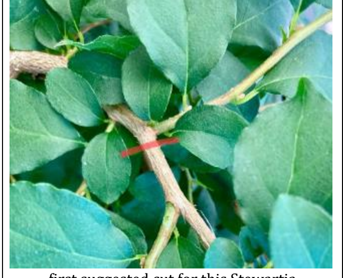
first suggested cut for this Stewartia

The takeaway her is that with a strong tree and scissors, you can create movement without wire. It takes a little looking and thinking –what direction you want the branch to grow, and how long you want the segment you're working on.