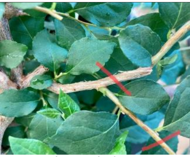
another example of two cuts