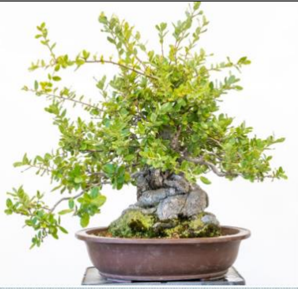
Cork oak with strong shoots on the upper half of the tree