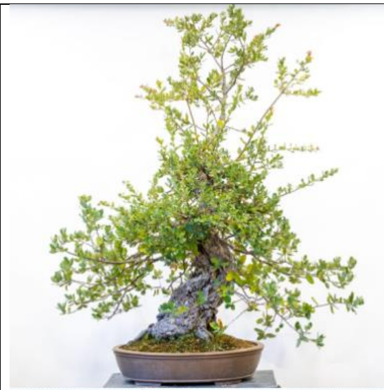
Cork oak before pruning

This hasn't caused problems for the tree but it did slow down progress.