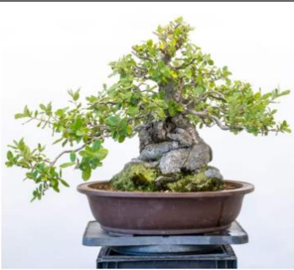
After pruning all but the lowest branches - 16"

The plan for the rest of the growing season is to maintain the silhouette on the upper branches while letting the lower branches run until they reach the desired thickness.