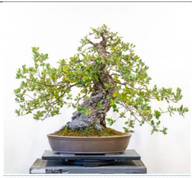
After pruning the upper branches - 27"

When the lower branches reach the desired thickness I'll shorten them and repeat the process to create taper. Once this basic structure is in place, I can focus on branch development on all of the branches to create the silhouette I have in mind for the tree.